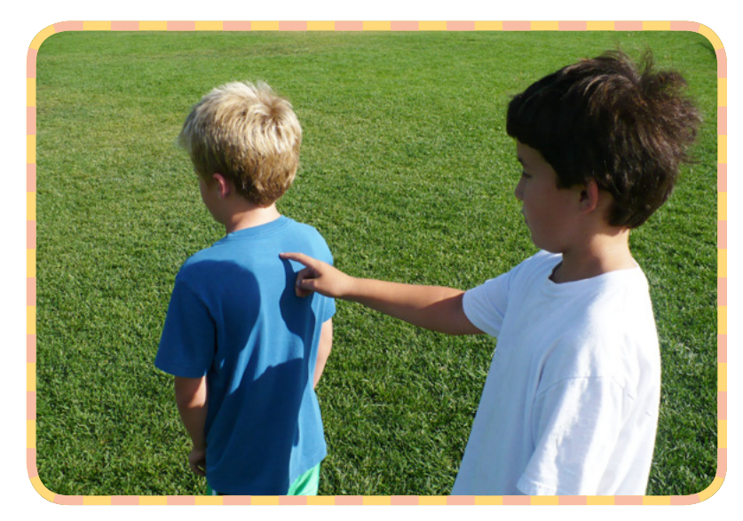
One student draws a letter or number on his partner's back. The backboard student must guess the letter or number.